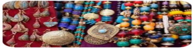
Dreamz Yatra Shopping Places in Andaman ...