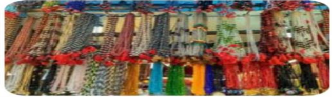
The Times of India Places To Shop In Andaman a...