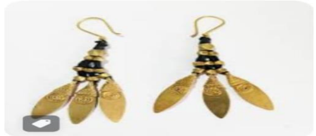
Ritikart · In stock Buy Online Tribal Jewellery Dho...