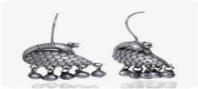
IndiaMART Alike Oxidised Jewellery ...