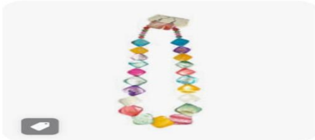
AndamanMarket · In stock Multicolor Natural Pearl Neck...